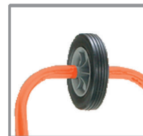
Truck Loading Wheel