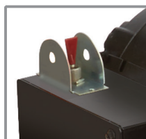
Momentary Contact Reverse Switch

“ We prefer General to other brands. Our customers are satisfied, and so are we! Garden True Value Hardware, Garden City, KS ”