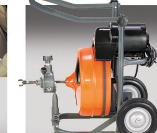
The handle is tall enough to make it easy to move to the job, yet it can be quickly folded to take less