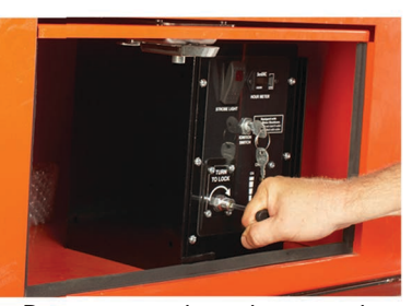
Remote control panel protected inside a locked toolbox.