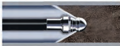
Wide spray flushing nozzle cleans inside of pipe thoroughly.