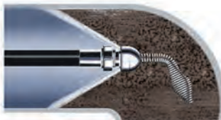
Spring Leader nozzle helps guide hose around tight bends and P-traps.