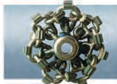
FR-3TAZ 3" Circular Carbide Tipped Chain