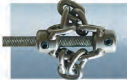
FR-2CK 2" Chain Cutter – Double Chain For PVC and Soft Stoppages