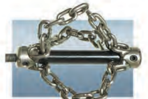
FR-3-4CK 3" – 4" Chain Cutter – Triple Chain – For PVC and Soft Stoppages