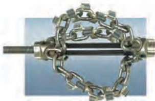
FR-3-4HDCK 3" – 4" Heavy Duty Carbide Tipped Chain Cutter – Triple Chain – For Roots and Descaling