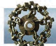
FR-4TAZ 4" Circular Carbide Tipped Chain