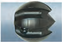
FR-1-1/2CG 1-1/2" ClogChopper Cutter for Flexi-Rooter