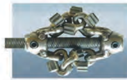
FR-2HDCK 2" Heavy-Duty Carbide Tipped Chain Cutter – Double Chain – For Roots and Descaling