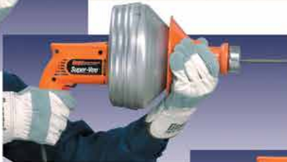
2 Pull cable out of drum.