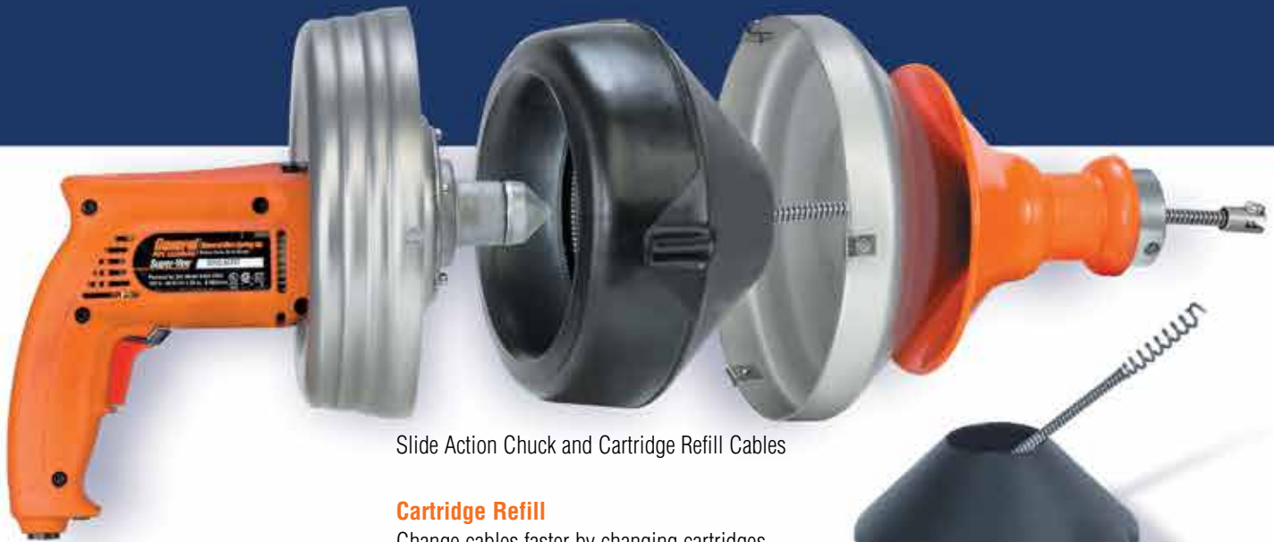
Slide Action Chuck and Cartridge Refill Cables