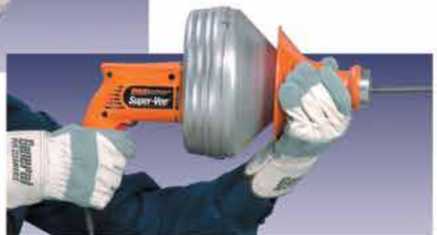
4 Run cable into line and repeat. It's that quick!