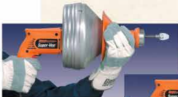
1 Slide Grip Shield Forward to release cable.