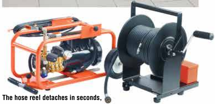
The hose reel detaches in seconds, to make the jet more compact and portable.