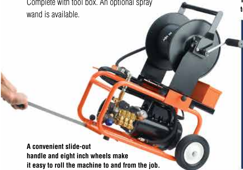
A convenient slide-out handle and eight inch wheels make it easy to roll the machine to and from the job.