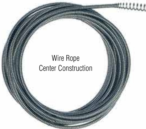
Wire Rope Center Construction