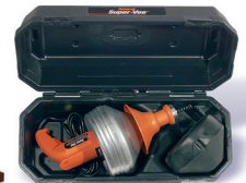
MCC Carrying Case

General General Wire Spring Co. PIPE CLEANERS McKees Rocks, PA 15136 USA 800-245-6200 or 412-771-6300