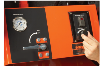
Easily accessible Variable Speed rewind control, along with pressure gauge and output valve mounted between hose reels.