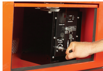
Remote control panel protected inside locked toolbox.

Standard safety features include electric brakes, safety strobe light, three safety cones with holder, rear fold down stabilizer jacks, and retractable guide arm. An anti-freeze system protects the unit from freeze damage. Complete with spray wand and trigger.