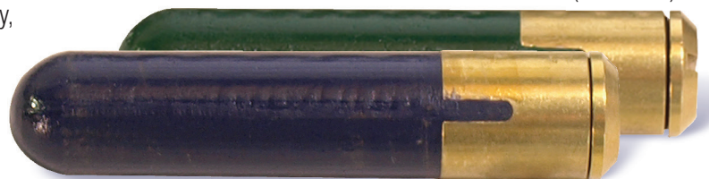
Sonde 20 (actual Size)